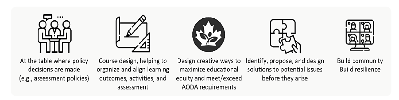
Figure 3: College issues that can benefit from student perspectives and involvement (Flynn, 2020, University Affairs)

Flynn (2020) identifies several ways student input and voice can be used to influence a variety of college functions. Being intentional about how and why student input is gathered and involving students in important initiatives at the college will better meet the needs of students.