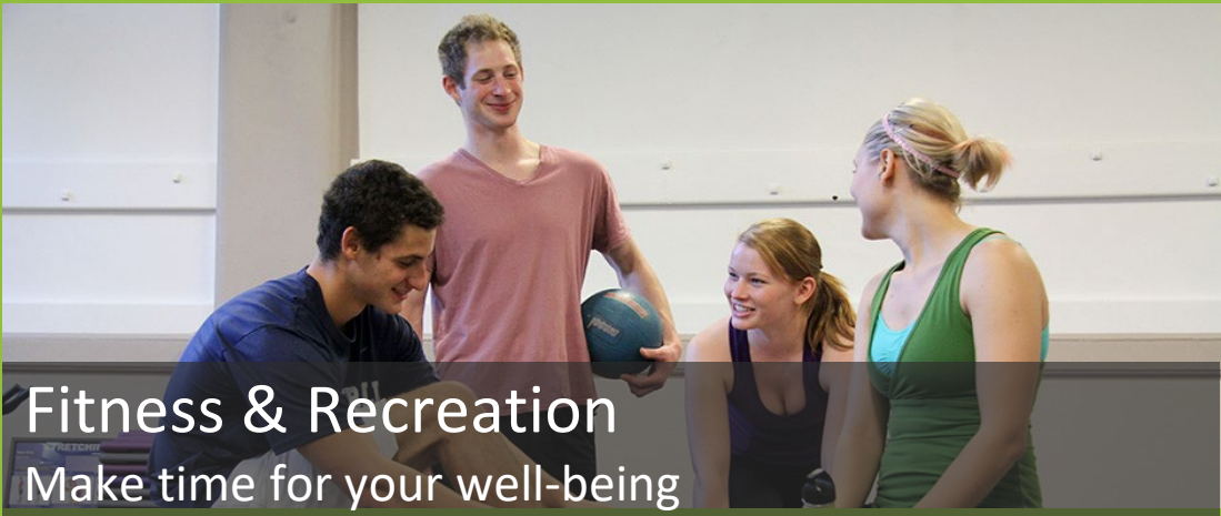
Fitness & Recreation Make time for your well-being