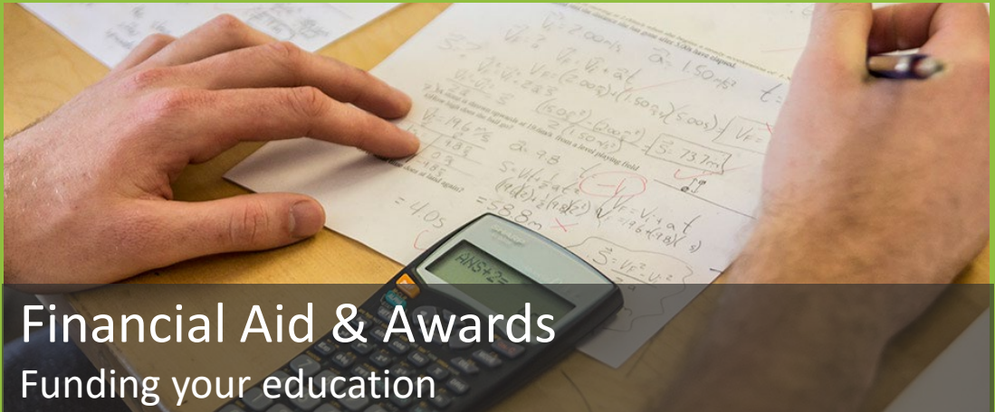
Financial Aid & Awards Funding your education