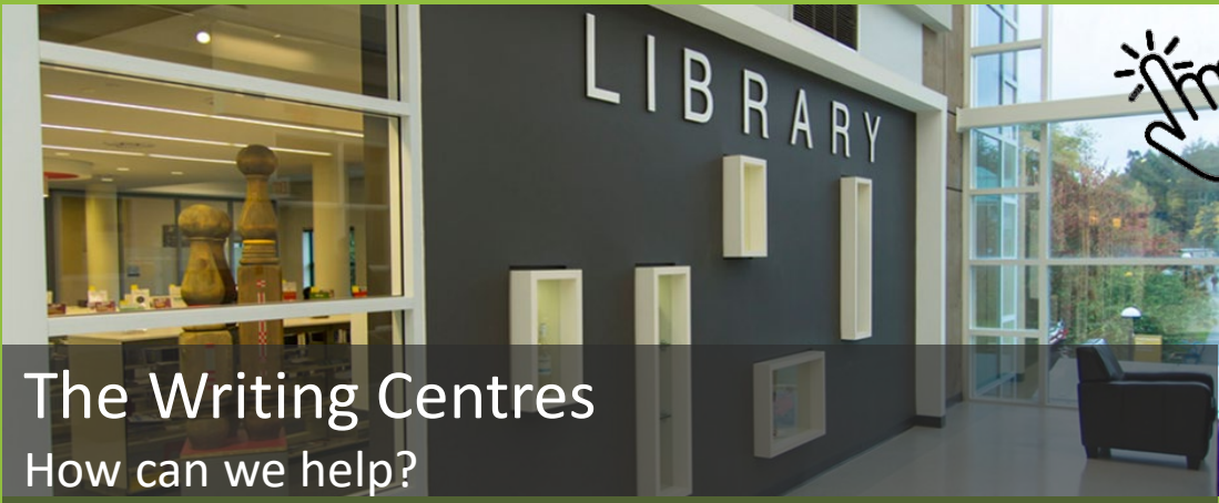
The Writing Centres How can we help?