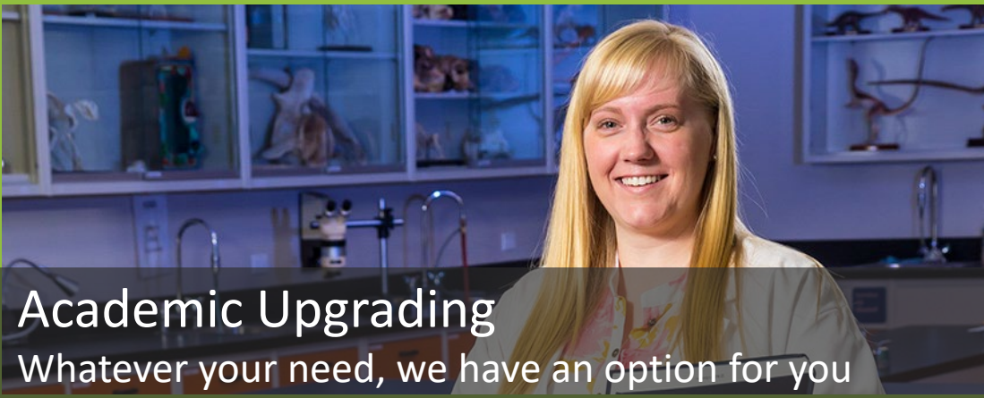
Academic Upgrading Whatever your need, we have an option for you