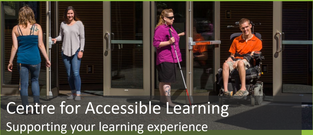
Centre for Accessible Learning Supporting your learning experience