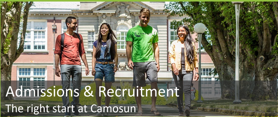
Admissions & Recruitment The right start at Camosun