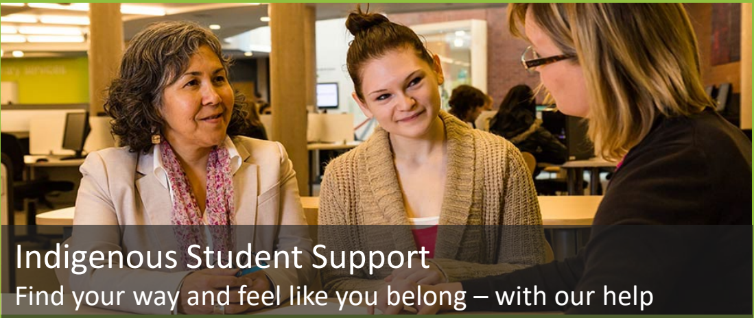
Indigenous Student Support Find your way and feel like you belong – with our help