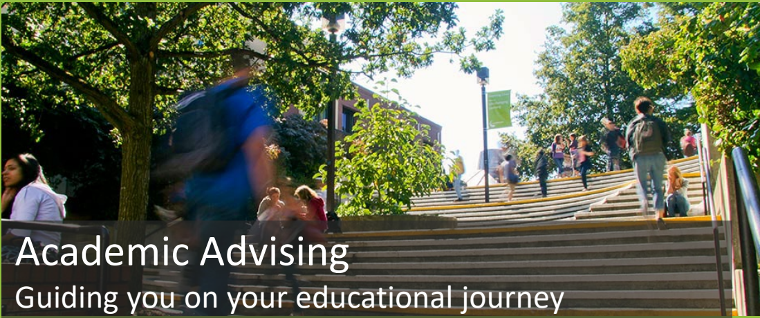
Academic Advising Guiding you on your educational journey