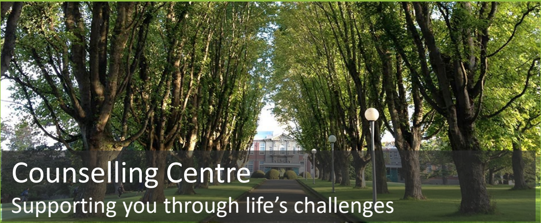
Counselling Centre Supporting you through life's challenges