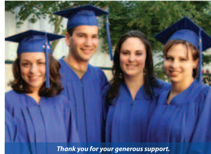
Thank you for your generous support.