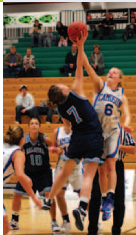
Camosun Chargers women's basketball team rose to new heights this year, taking silver in their first-ever BC Provincial Championships!